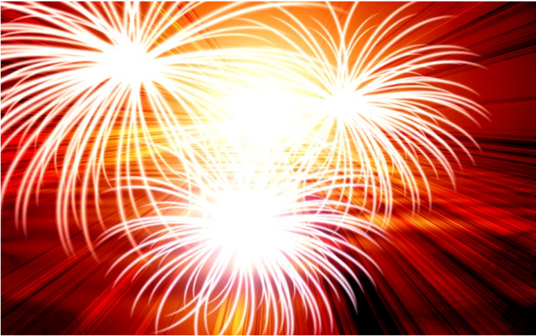
St. Jean-Baptiste Day Celebration

The second annual St. Jean-Baptiste Day Celebration, sponsored by the Frenchtown Historical Foundation, will take place on Saturday, June 22, 2013.