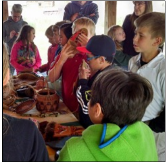
Assumption elementary students get a hands-on look at the cultural heritage of Frenchtown.